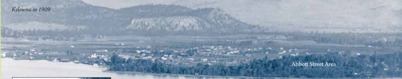
Abbott Street Area