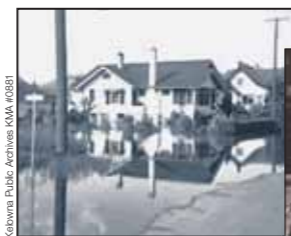
McDougall Street houses during spring flooding in the 1930s. The centre house is a Fumerton family home on the corner of Vimy and McDougall.