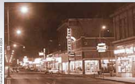
Fumertons Department Store on Bernard Avenue at Pandosy Street in 1966. Residents from the Abbott Street area were involved in many local enterprises.