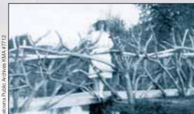
A young woman uses the branch-lined Abbott Bridge to cross Mill Creek, c. 1920.