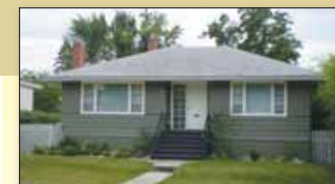
A vintage bungalow home on Glenwood Ave.

Modern, convenient and popular, the post-WWII bungalow style has many variations in the Abbott Street area.