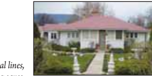
Jackson House , built 1922, 236 Beach Avenue