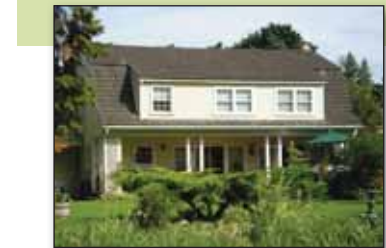
A rare example on Riverside Avenue.