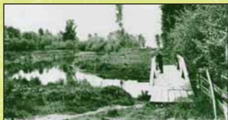
The Abbott Street bridge over Mill Creek in 1907. In the 1940s the winding creek was straightened and the reclaimed land became the Maple Street area. Over the years, much of the marshy land along the lake was filled in with sawdust from the sawmill.

Ten years have shown that the establishment of these heritage neighbourhoods have been a successful initiative with lasting benefits for the neighbourhoods and the community.