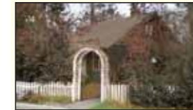
A. Treadgold House , built 1936, 1077 Abbott Street