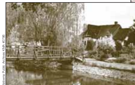
A 1930s view of the Mill Creek bridge and walkway near the Ryan House (built 1924) on Riverside Avenue. The bridge connected residents to downtown and City Park.