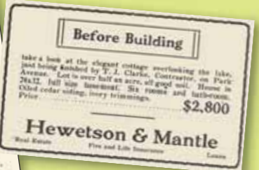
Kelowna Courier advertisements, c. 1909